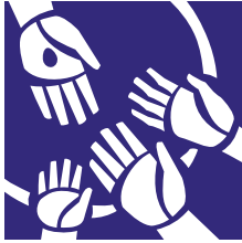
CORPUS CHRISTI CATHOLIC CENTER